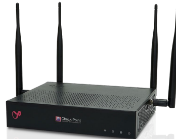
Quantum Spark 1570, 1590 Wi-Fi