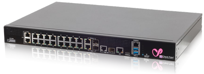
Quantum Spark 1800