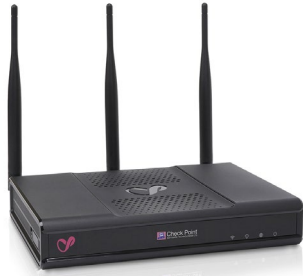
Quantum Spark 1530, 1550 Wi-Fi