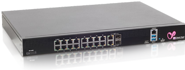
Quantum Spark 1600